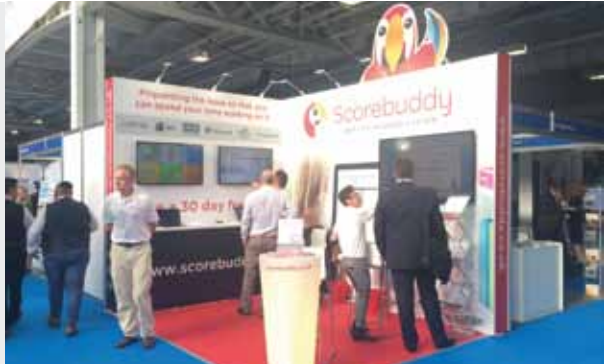
SENTIENT SOLUTIONS / SCOREBUDDY Call Centre Expo Olympia London, UK