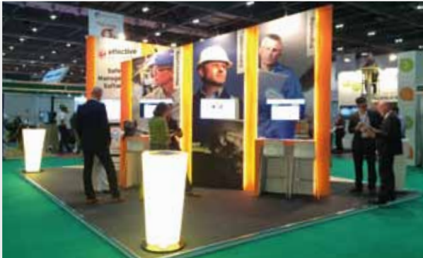
EFFECTIVE SOFTWARE Safety and Health Expo Excel London, UK

We specialise in UK and European Exhibitions