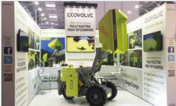
ECOVOLVE LTD Bauma Trade Fair, Messe Munich, Germany