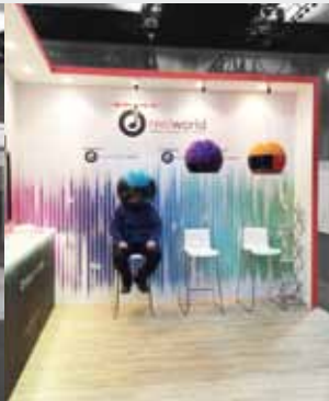
Radiodays, CCD Dublin, Ireland