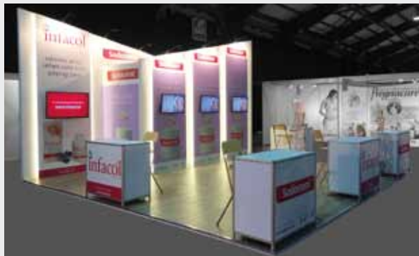
FOREST LABORATORIES SUDOCREM

The Irish Pregnancy and Baby Fair, RDS Dublin