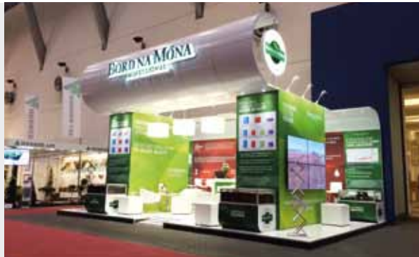
BORD NA MÓNA PROFESSIONAL

We specialise in UK and European Exhibitions